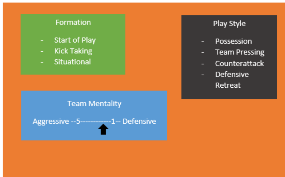
Figure 3. Team Manager

In our current implementation, configuration of the Team Manager does not change during a match and is only pre-programmed before the start.