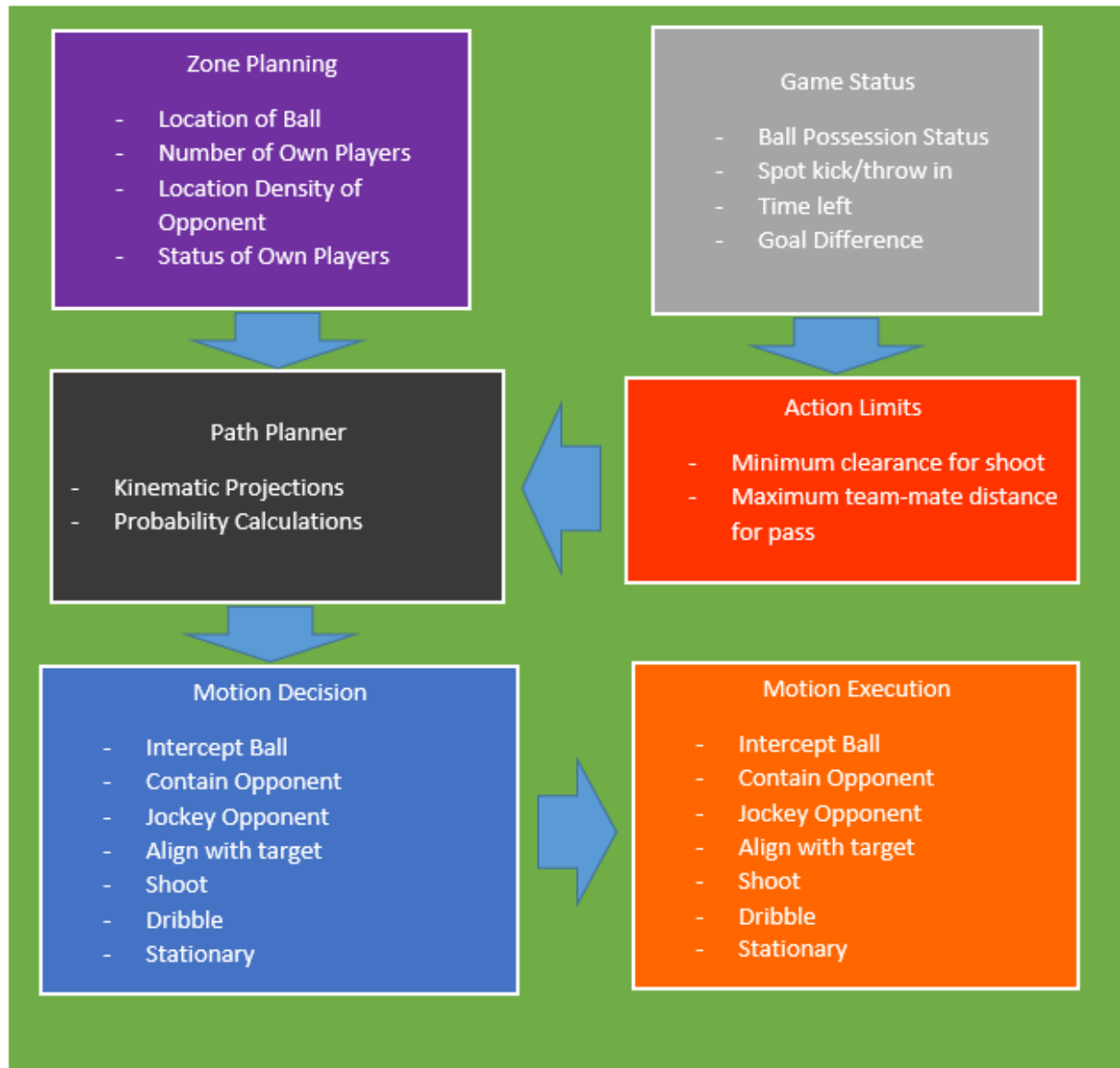
Figure 4. Robot Processing Module